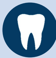
Dental Care or Eye Screenings