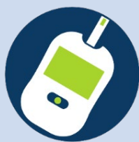
Blood Glucose Testing Supplies